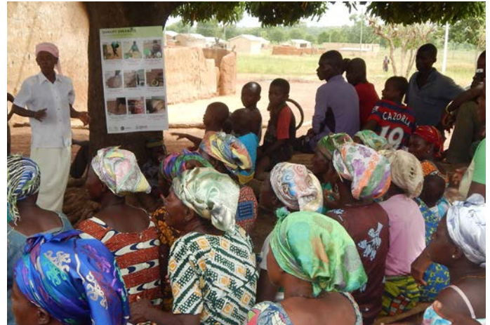
GSA members use quality poster to train women collectors

The working group also discussed mineral oil, aflatoxin, and insecticide contaminations. The working group recommended further stakeholder engagements and discussions to find common solutions to mitigate the challenges identified.