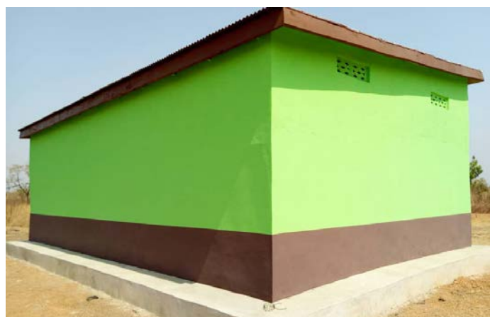
Warehouse constructed with gravel blocks in Fuu, Ghana.

Mahama Alhassan - Presbyterian Agricultural Services