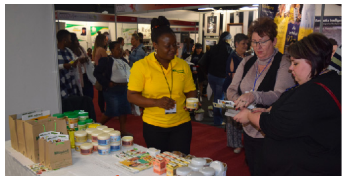
Middle East Organic & Natural Products Expo is the largest event for organic and natural products in Dubai