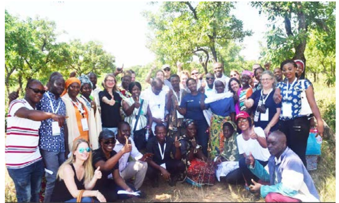
SWG Volunteers visiting shea parklands in Gupanarigu, Ghana

They also reviewed and adopted the vernacular warehouse manual which will be published by the summer. This manual provides a variety of options to partners for constructing warehouses in the communities at lower costs.