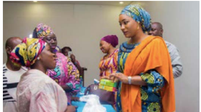
The Second Lady of the Republic of Ghana - Her Excellency Samira Bawumia delivered a keynote speech at the opening ceremony